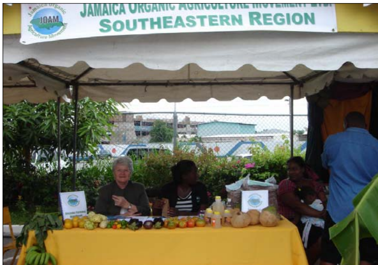
JOAM booth; Wellfest 2006

Wellfest is an annual festival which promotes overall wellness. JOAM is committed to attending Wellfest every year because it provides an opportunity to be in the company of like-minded individuals who are involved in promoting general wellness.