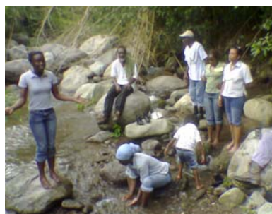
PLATE 1: Bonding in the river after farm the day in St. Andrew